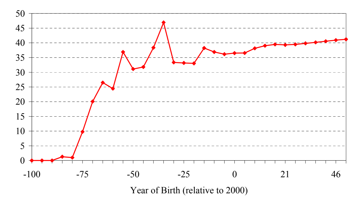
Figure 2. Percent Change in Net Payment due to Reunification (South Korea, Tax Adjustment)