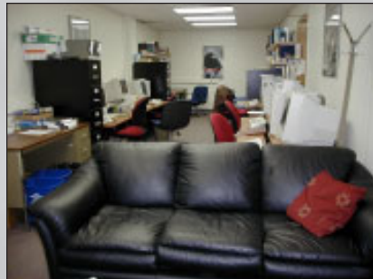
Views of Room 608-11: before (left) and after (right)