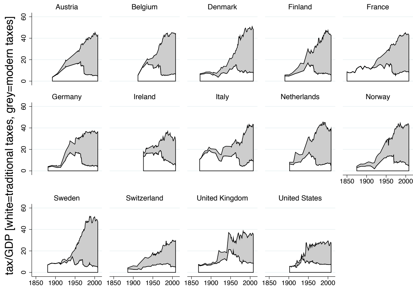
Figure 3: Modern and Traditional Tax to GDP ratios over time in 14 countries

Each panel plots, for a given country, the time series of the total tax revenue to GDP ratio and splits it between traditional taxes (in white) and modern taxes (in grey). Modern taxes include individual and corporate income taxes, payroll taxes and social security contributions, and Value Added Taxes. Traditional taxes include all the other taxes. Source is Flora (1983) before 1965 and OECD from 1965 to 2008 (see appendix for complete details).