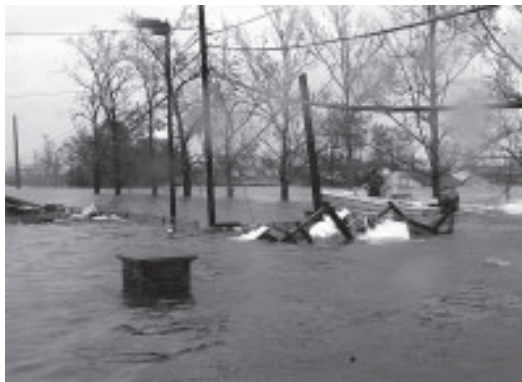
In 2004, Americans made nearly $250 billion in charitable donations; 2005 donations could exceed that amount, with cleanup and rebuilding costs in the wake of Hurricane Katrina (New Orleans, above) and other U.S. natural disasters.

He acknowledges that a common complaint of those who don't give as much as they can afford is that their donation seems all but irrelevant because of the staggering challenges that charities face.