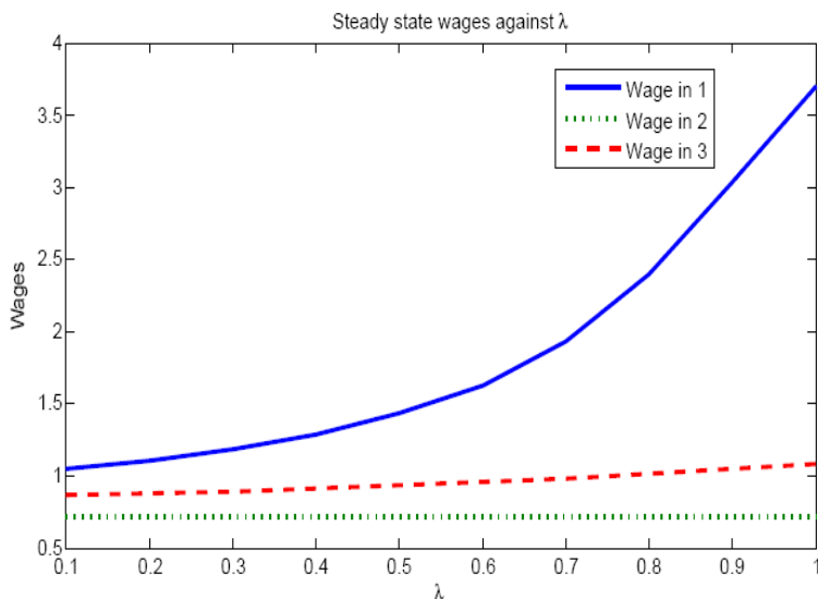
Figure 2: This simulation uses \theta = 8 , \phi_1/\phi_N = 1 , \phi_2/\phi_N = 0.04 , and \phi_3/\phi_N = 0.2 .