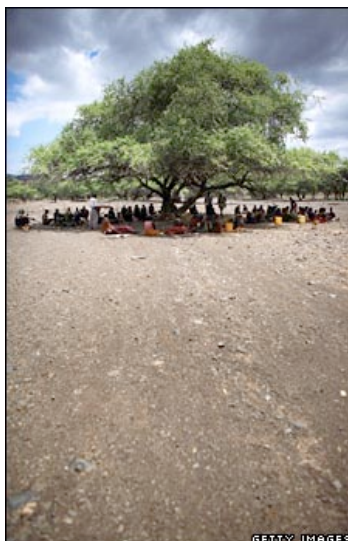
Northwestern Kenya's drought has brought conflict between pastoralists