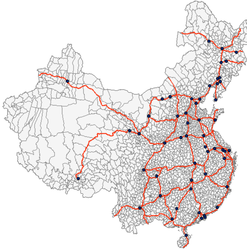
Figure 1: China's National Trunk Highway System

The figure shows Chinese county boundaries in 1999 in combination with the targeted city nodes and the completed expressway routes of the National Trunk Highway System (NTHS) in the year 2007.