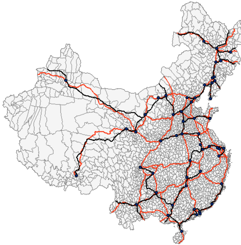
Figure 2: Least Cost Path Spanning Tree Network

The network in red color depicts the completed NTHS network in 2007. The network in black color depicts the least cost path spanning tree network. The black routes are the result of a combination of least cost path and minimum spanning tree algorithms. In the first step Dijkstra's (1959) optimal route algorithm is applied to land cover and elevation data in order to construct least costly paths between each bilateral pair of the targeted destination. In the second step, these bilateral cost parameters are fed into Kruskal's (1956) minimum spanning tree algorithm. This algorithm identifies the subset of routes that connect all targeted nodes on a single continuous network subject to global construction cost minimization.