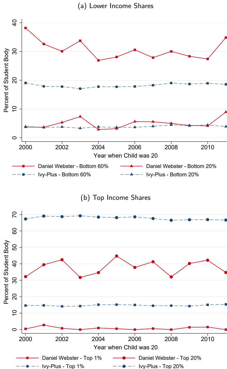
Figure 3: Trends in Parent Household Income, 1980-1991 Birth Cohorts

The Mobility Report Card also includes statistics on how the parent income distribution at Daniel Webster has evolved since 2000, when our data begin. Figure 3(a) shows the share of students from the bottom 20% and bottom 60% of the income distribution, while Figure 3(b) shows the share of students from the top 1% and top 20%.