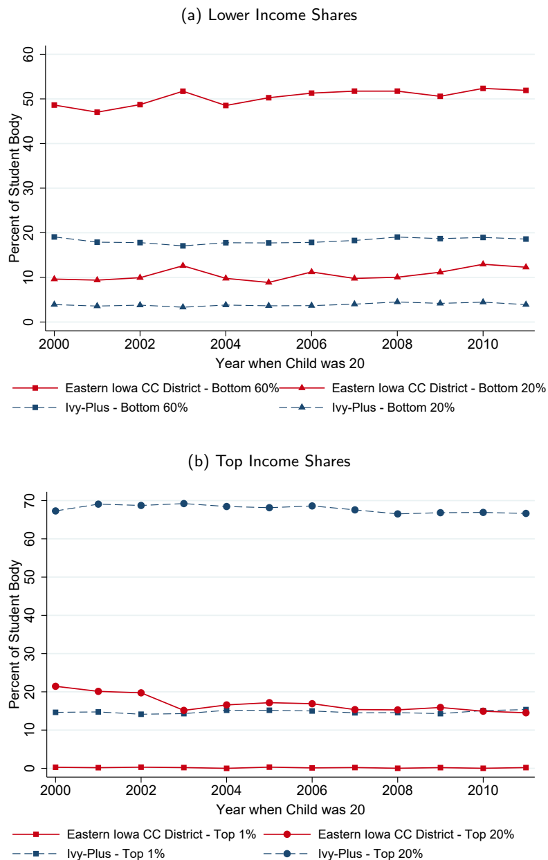
Figure 3: Trends in Parent Household Income, 1980-1991 Birth Cohorts

The Mobility Report Card also includes statistics on how the parent income distribution at Eastern Iowa CC District has evolved since 2000, when our data begin. Figure 3(a) shows the share of students from the bottom 20% and bottom 60% of the income distribution, while Figure 3(b) shows the share of students from the top 1% and top 20%.