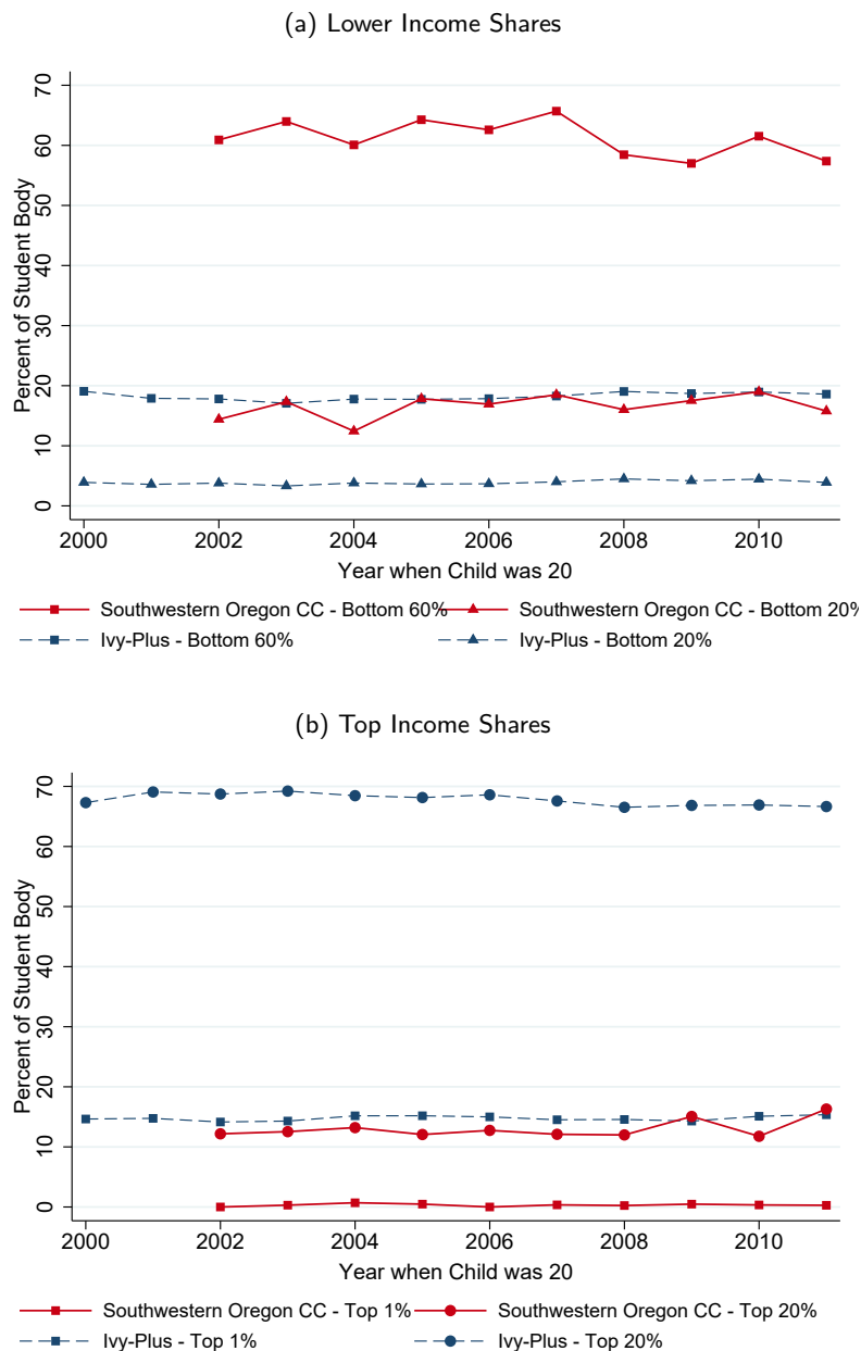
Figure 3: Trends in Parent Household Income, 1980-1991 Birth Cohorts

The Mobility Report Card also includes statistics on how the parent income distribution at Southwestern Oregon CC has evolved since 2000, when our data begin. Figure 3(a) shows the share of students from the bottom 20% and bottom 60% of the income distribution, while Figure 3(b) shows the share of students from the top 1% and top 20%.